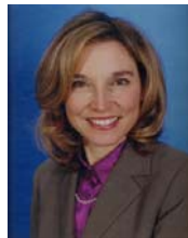
Mayor Debbie Cook Huntington Beach, CA